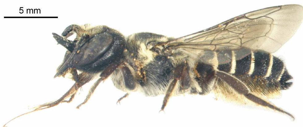
FIGURE 6. Megachile armaticeps (female) showing facial projections. This charismatic species is the only Cuban bee listed in the International Union for the Conservation of Nature “Red Book” of endangered and threatened species. There is need for more study to clarify the threatened status of this bee.

We lack quantitative data to evaluate the current status of the populations of Cuban insects and bees are no exception (and this should be a major concern). An endemic bee, Megachile armaticeps Cresson (Fig. 6) is on the list of the threatened species of the International Union for the Conservation of Nature (IUCN). It was proposed (Genaro 1998c) as vulnerable due to the fragmentation and loss of its habitat and possible competition with the introduced Megachile lanata (Fabr.), which has led to it having a small population restricted to a very few places.