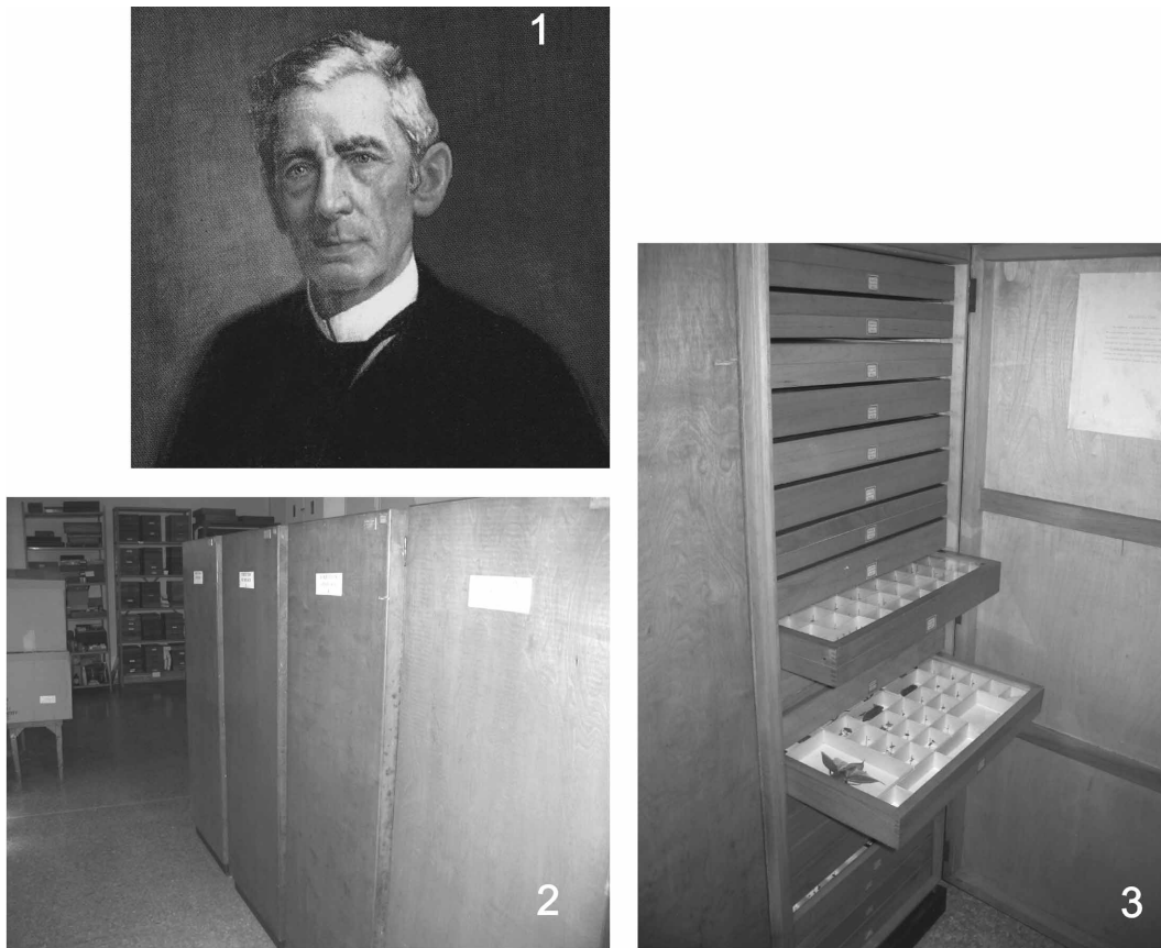
FIGURES 1–3. Gundlach and his collection. 1. J. C. Gundlach (1810–1896) ( Canvas at Cuban National Museum of History of Sciences ). He published the most complete account of Cuban bees until Alayo's (1973) catalog. 2 and 3. Gundlach's collection is housed at the Institute of Ecology and Systematic (IES), Havana City. This important historical collection holds the largest number of primary insect types in Cuba.